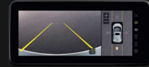
Rear 2D View