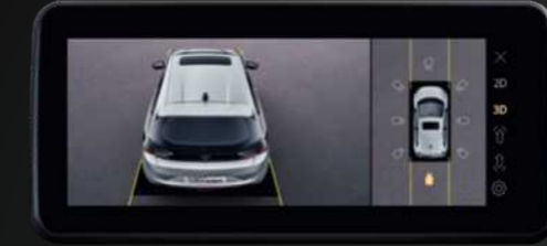
Rear 3D View