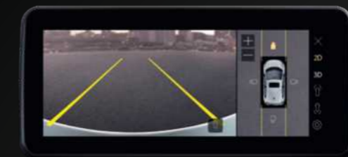
Front 2D View

Step into the future of convenience, where the tangle of cords is replaced by the simplicity of wireless power. Just place your phone and watch it come to life.